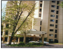
Luther Towers Apartments, Memphis, Tennessee 196 Units $3,200,000 Section 8 HAP – 4% LIHTC Advisor