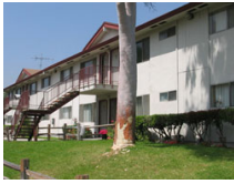
Pierce Park Apartments, Pacoima, California 430 Units $17,500,000 Section 8 HAP – 4% LIHTC Advisor