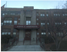
School I & II Apartments, New Britain, Connecticut 226 Units $12,500,000 Section 8 HAP – 4% LIHTC Advisor