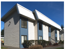
Hidden Firs Apartments, Lynnwood, Washington 62 Units $6,900,000 Section 8 HAP – 4% LIHTC Advisor