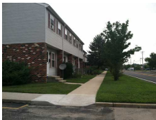
Penny Point Park Apartments, Egg Harbor, New Jersey 152 Units $8,720,000 Section 8 HAP – 4% LIHTC Advisor