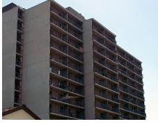
Flower Terrace Apartments, Santa Ana, California 200 Units $31,000,000 Section 8 HAP – 4% LIHTC Advisor