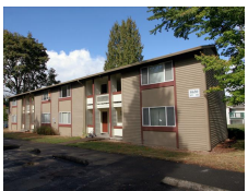
St. Johns Woods Apartments, Portland, Oregon 124 Units $8,287,500 Section 8 HAP – 4% LIHTC Advisor