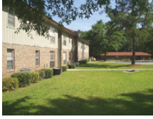
Southern Intercoastal Portfolio, South Carolina, Georgia 429 Units $9,445,000 Section 8 HAP – 4% LIHTC Advisor