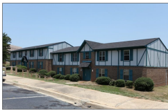
Keystone Apartments, Jonesboro, Georgia 184 Units $11,800,000 Section 8 HAP – 4% LIHTC Advisor